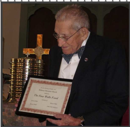
Dedication of the Four Walls Fund